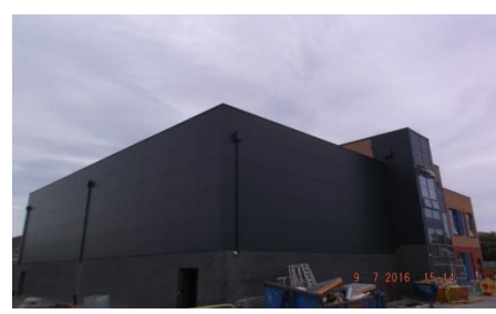
Cladding to the sports hall is complete.

The construction of the new Reading Girls' School building is in the final stage and heading towards completion. The following photographs show recent progress. Looking ahead – the sports hall and assembly hall flooring will be laid and the bleacher seating installed. Commissioning of live services and snagging will happen in the next five weeks. Decant of the existing school will start on 22<sup>nd</sup> July and continue throughout the summer along with all new and legacy furniture being delivered.