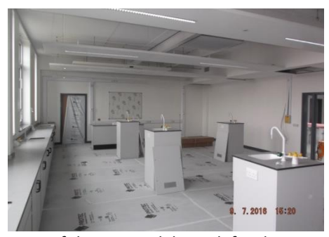
One of the science labs with fixed furniture.