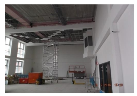
Finishing touches to the assembly hall.