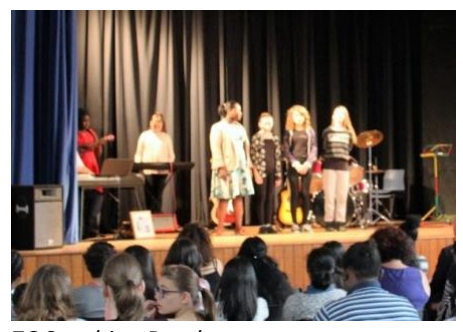
7C Sunshine Band

This term has been a super one in the Music Department seeing excellent work from Year 7, 8 and 9 pupils. Classes worthy of note are 7C and 7S for the fabulous commitment they showed in developing the 'Walking on Sunshine' topic.