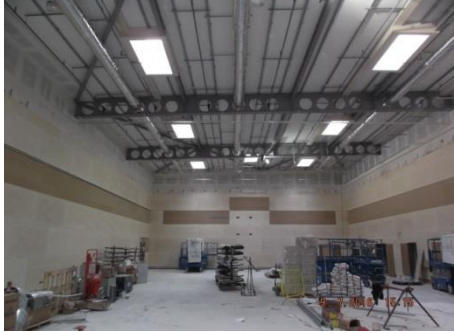
Internal finishing touches to the sport hall are being applied.