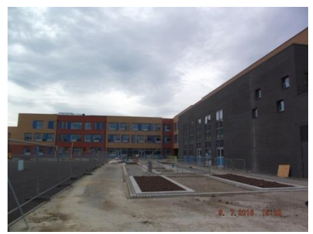
Externally, the hard landscaping has commenced and the rooftop services are nearing completion.