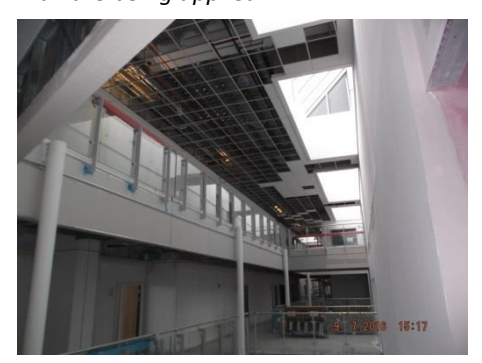
Finishing touches to the communal area.