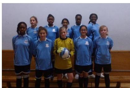
Yr7 Football team

We had a very keen and enthusiastic squad this year. The girls developed week by week improving their skills and positioning. By the last round of the league, of their four games, they drew one and won three, winning the last game against Blessed Hugh Faringdon 3-0. Well done.