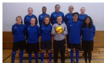
Year 10 GCSE PE students attempt Paralympic Sports

This was also the first time they were playing in the 9 a-side format for the school league. Although they suffered a few losses they drew some games and had a couple of good wins. It was also good to welcome some new players to the team.